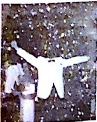
Seniors go wild after bash of the '67 senior ball

The entire evening was a spectacular success, thanks to our great advisors, patient parents and a great bunch of kids.