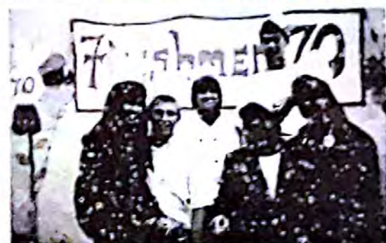
Newly crowned Playday Royals.

For those students who didn't wish to attend the dance, the library was opened for the stu-