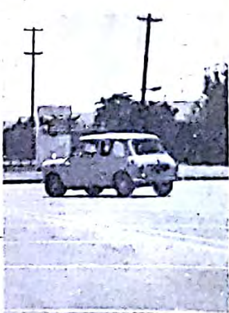
....Turns on a dime too!