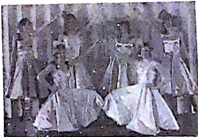
Can-Can Dancers of the Spring Concert

All attempts for a record-breaking jump were hampered by: hot weather, change in elevation, stage fright, and/or amorous feelings toward a female frog from Modesto. But Hercules has promised not to get side-tracked next year, and he predicts complete victory in Angels' Camp in 1968.