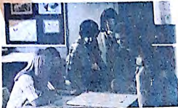
Preparing for the Prom