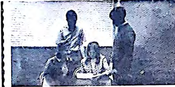
Award winners practicing for upcoming test.