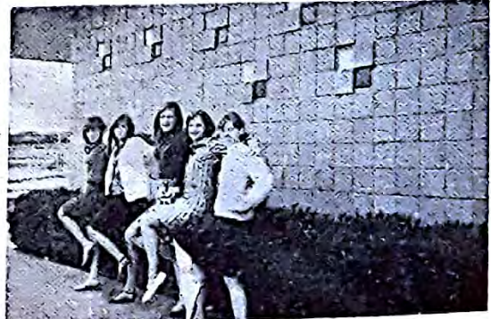
Can can girls will brighten the Spring Concert next month.

Upcoming events this spring for Blackford High's concert band are performances at the California Music Educators Association State Band Festival on April 29 and at graduation on Wednesday, June 14.