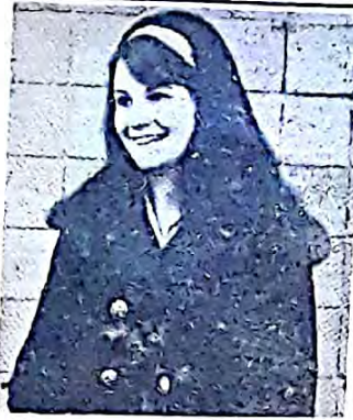
"Funny Girl" requires hard work.

A very "Funny Girl" from Blackford's student body will play the part of Jenny, the lead dancer, in the production by the San Jose Light Opera Association.