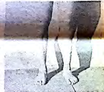
Guess whose legs these are.

All the girls advised, "don't give up" to future Song Girl candidates. They agreed that a prospective Song Girl has to have a lot of time and be prepared to work hard. During the fourth quarter tryouts will be held for new Song Girls. There will be six openings.