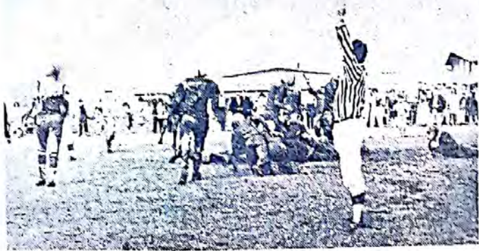
Muddy Thanksgiving Day Action on Braves' Field

Cheers and yells will be heard no more on the football field, this year as the Blackford Braves have closed the season by losing to Saratoga, and to Los Gatos.