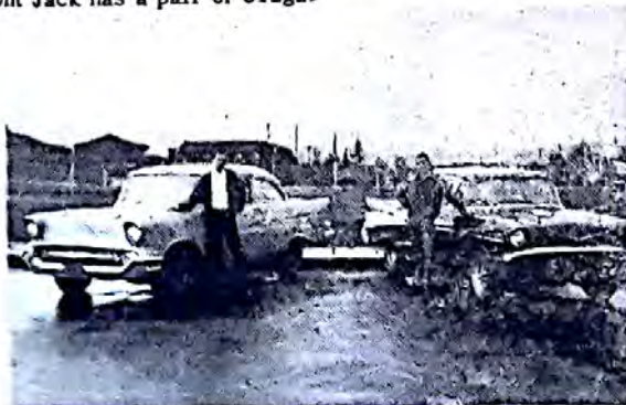
Brand (left) and Armstrong exhibit their Chevys.

mags on blackwalls. Roy's yellow taxi also features fuel injection heads and pistons, and a dual point distributor. Behind that power pack Roy has a 3-speed with overdrive and a 4:11 rear end. Amazingly enough, both cars also enhance their interior with black naugahide, Stewart-Warner gauges, and tacks. Jack differs his cockpit with a custom steering wheel while Roy's sports a Fenton "500" floor box.