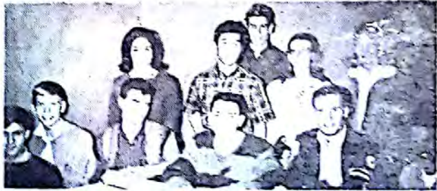
Braves' Student Council in action.

This year's program will be Saturday, February 5, from 8 a.m. to 5 p.m. at Foothill College. To benefit high school sophomores, juniors, and seniors attending, the day will consist of panels, exhibits, and a tour.