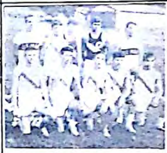
Coast Sectionals to be held at San Mateo on Thursday November 19.

Ten of the harriers will continue to practice for the North