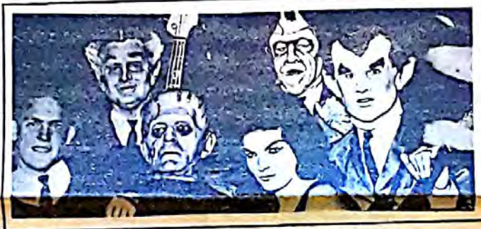
The LANCE staff is always ready to serve you!

Newspaper editors from high schools all over the bay area attended a high school press conference last Oct. 31 at San Francisco's Wax Museum. The special guests were the "Munsters", a recording group which started because of the recent monster craze currently sweeping the country. The Munsters, pictured above with a wax dummy of Frankenstein, got the idea for their makeup from the television series, The Munsters.