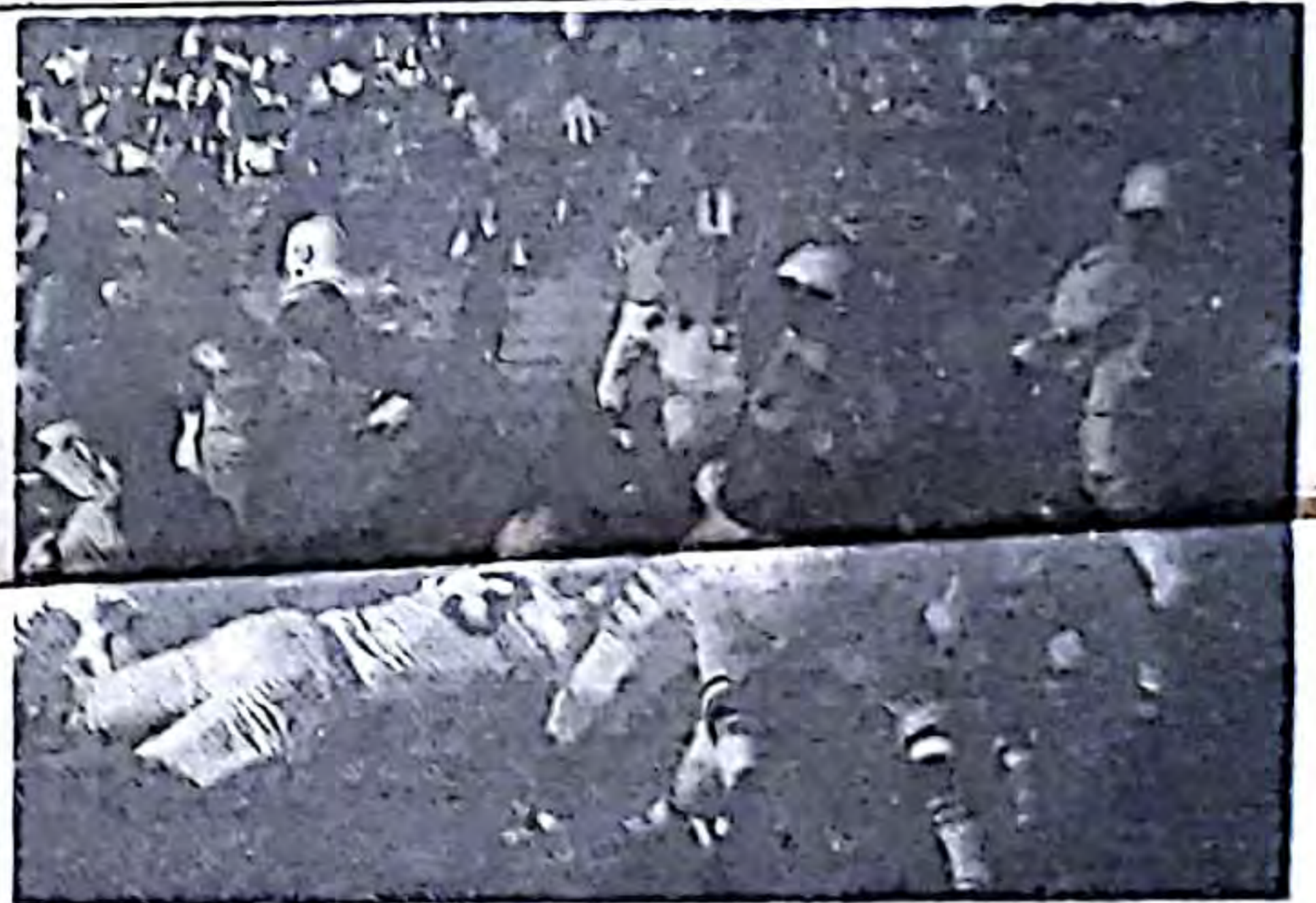
Varsity in league play with Del Mar