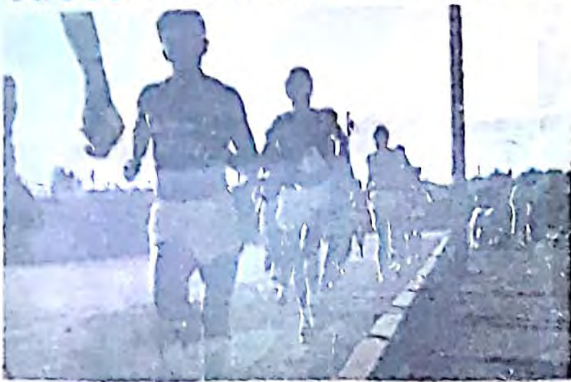
The Great Braves Cross Country Team