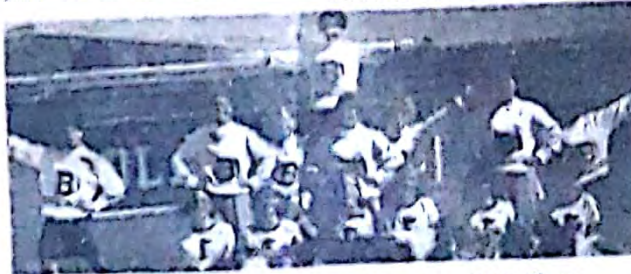
66-67 Song Girls and Cheerleaders.

The girls have more fun together and agreed that their happiest moment was the day of the final tryouts.