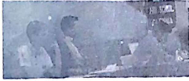
Key Club makes decisions.

Mrs. Lozano is now showing a one woman art exhibit at Five ... in Los Gatos until the