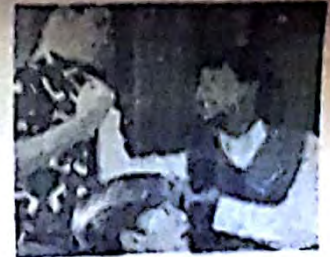
Scene from 'Mrs. McThing'

Many projects are already in progress, and are sponsored by Santa Clara County. Campbell Union High School worked in conjunction this summer under Summer Humanities Workshop. $8,175.00, an operational grant, was provided to sponsor a complete production of "Brigadoon".