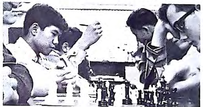
Chessmen and their constant battle field.