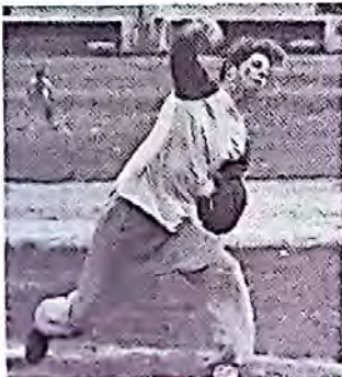
SB practice in proaress

Blackford's Varsity baseball team is looking forward to a