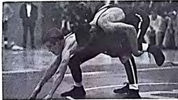
Blackford wrestlers ready for WV Finals

After the final round of competition, Blackford was in third place.