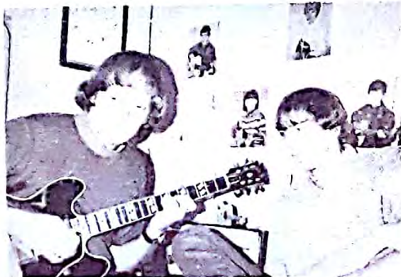
"You expected Joan Baez maybe?"

Unfortunately, Dearest D.&J. shall be discontinued due to the lack of response from the lovers. We haven't received enough nor adequate material to keep the column going.