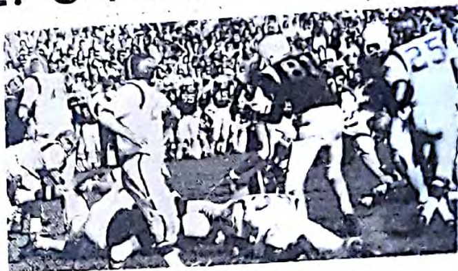
Unidentified Brave Recovers Falcon Fumble.

The traditional series is now tied at three games apiece.