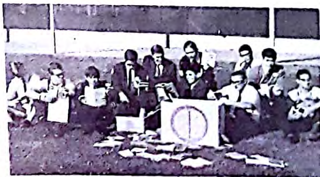
Interact Club members checking books to be shipped

The club plans an annual car wash which will be coming up in the near future. The Northern California Interact Convention to be held March 16, at Saratoga, is the club's most important coming event of 1968.