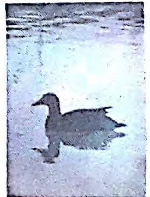
Duck ducks out

Can you imagine anyone coming to school when they don't have to? Well, last week Blackford was honored with the presence of Mr. Darrell D. Duck. Mr. Duck surveyed the school and took a liking to the pool, where upon testing the water temperature, decided to spend the day. Mr. Duck was people shy but when it came to taking his picture he was very cooperative. When interviewed by a Lance reporter and asked his impression of Blackford he replied, "I like to watch the girls swim, but my that swim coach has a loud voice! I may never leave." (And he almost didn't).